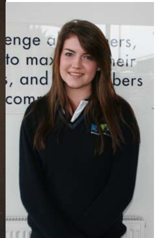
By Caitlin Funnell